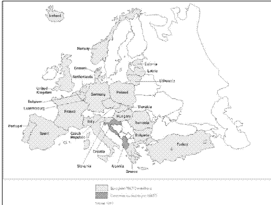
Figure 1: Countries Invited to Join NATO and Current European NATO Members.

for both NATO and U.S. budgets. 2 President George W. Bush submitted a classified report on Albania and Croatia to Congress on 28 March 2008 to meet this requirement, in advance of the invitation to begin accession talks that was issued to the two countries on 2 April 2008.