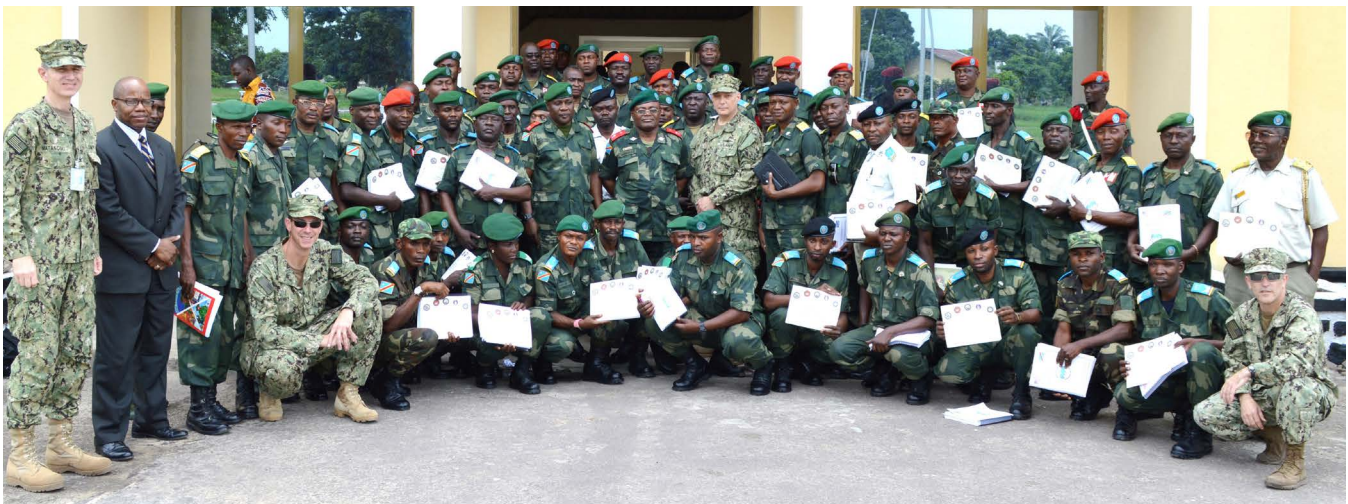
*Military Justice is an EIMET Core Element

All seminars include opportunities for presentations by host-nation lawyers on their current practices or planned military justice system, so the DIILS team can select the most useful examples and focus small group work on timely needs. Mock trials and administrative hearings, case studies, practical exercises, and group discussions provide opportunities for participants to experience relevant aspects of the U.S. military system in action.