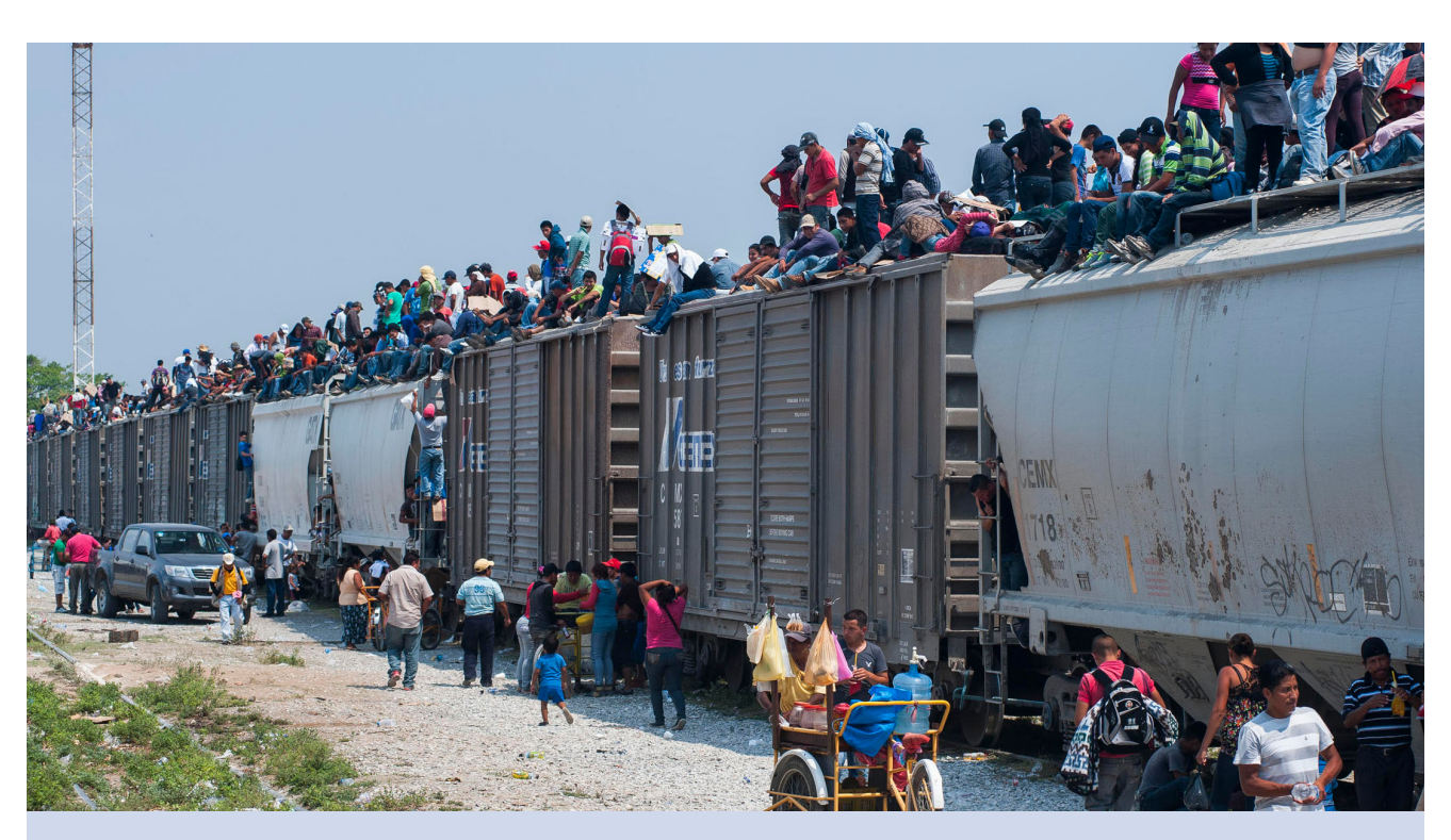
The instability and violence in Central America's Northern Triangle has driven many citizens to flee toward the United States. In this photo, a train full of migrants loads up near the Guatemalan-Mexican border.

Additionally, the U.S. needs to pass meaningful immigration reform. The tens of thousands of Central American children who illegally immigrated to the U.S. in 2014 and the subsequent images of them in "detention camps" were received poorly in Latin America.<sup>65</sup> U.S. immigration, either legal or illegal, is an important issue to all Latin