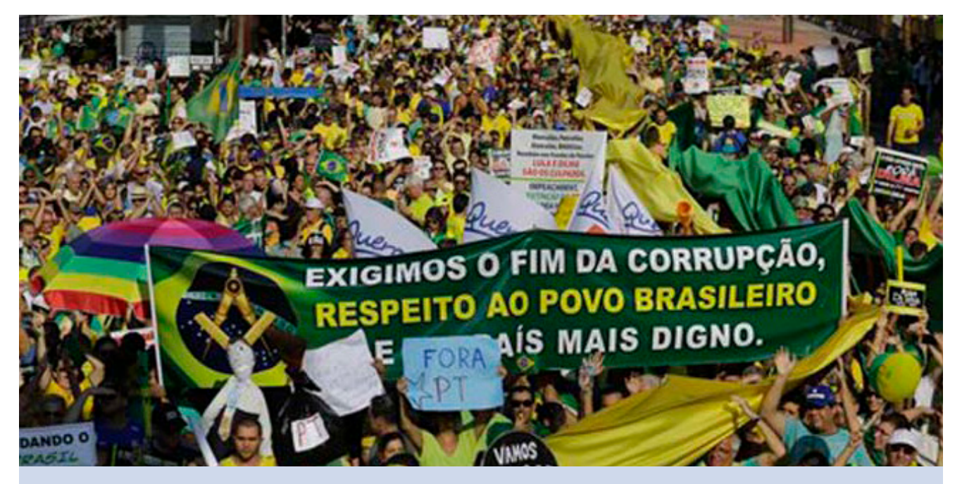
Massive protests over government corruption have sprung up all over Latin American including. In Brazil, allegations of President Dilma Rousseff's involvement in $220 billion Petrobras bribery scandal has led to calls for her impeachment.

Colombia, Honduras, Mexico, and Peru. <sup>50</sup> The U.S. can use the IGOs already in place it helped create when it internationalized its Foreign Corrupt Practices Act (FCPA) of 1977 with the United Nation's Anti-Bribery Convention, and the establishment of transparent evaluations through the Mutual Evaluation Process under the Financial Action Task Force (FATF). The FATF and its FATF-Style Regional Bodies (FSRBs) are making financial transactions more transparent. The objectives of the FATF are "to set standards and promote effective implementation of legal, regulatory and operational measures for combating money laundering, terrorist financing and other related threats to the integrity of the international financial system." The FATF's global network of FSRBs includes the regional Caribbean Financial Action Task Force (CFATF) and the FATF of Latin America, (GAFILAT). <sup>52</sup> The Western Hemisphere's Organization of American States (OAS) also adopted the Inter-American Convention Against Corruption (IACAC) in 1997, lending political credence to the matter. <sup>53</sup>