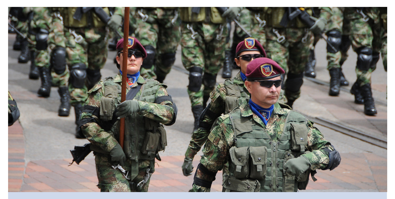
Colombia has become an "exporter" of security training to many of its Latin American allies, a byproduct of the expansion of the armed forces since 2001.

access to quality of life goods for both nation-states.<sup>58</sup> The net effect of these newly opened markets will enhance the U.S.'s soft power, which according to scholar Joseph Nye, may help a country "achieve its preferred outcomes in world politics because other countries want to emulate or have agreed to a system that produces such effects."<sup>59</sup>