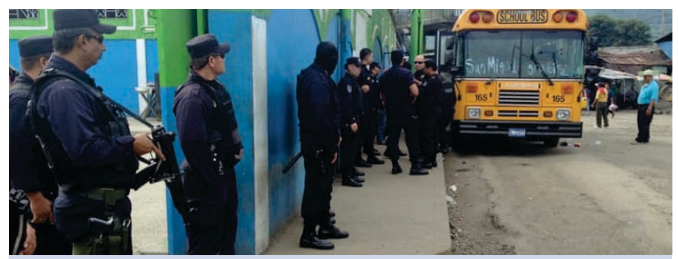
Photo caption: A heavy police presence is visible in many Salvadoran cities because of extreme gang violence.

"We have our new orders from the new business structure of our organization," said one midlevel MS 13 leader during a November interview in San Pedro Sula, Honduras. "All we care about is drugs, how to get it, how to move it, how to sell it. We have our territory now, and we make a lot more money. We don't meet our leaders face to face anymore, we only talk by special telephones, for security. We all get paid now, we work set shifts, we have AK 47s and mini Uzis, we have orders not to let anyone mess with civilians. The last two years have been amazing."