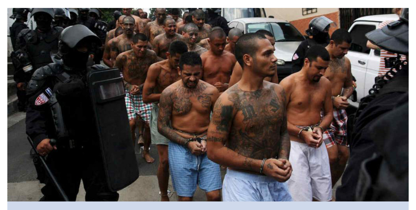
Photo caption: Members of the Mara Salvatrucha arrested in El Salvador in 2016.

This report draws upon findings from field investigations by seven researchers throughout the Northern Triangle over the past year. During that time, we conducted interviews with gang leaders of both the MS 13 and Barrio 18 gangs; residents of gang-controlled territory; law enforcement officials; journalists; and academics.