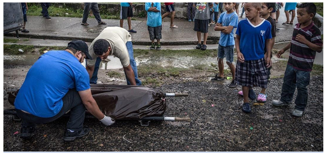
Photo caption: A victim of gang violence in taken away in San Pedro de Sula in 2016.

clothing items. According to our research, most of the material for these home operations is stolen from the large international maquilas that operate across San Pedro Sula.