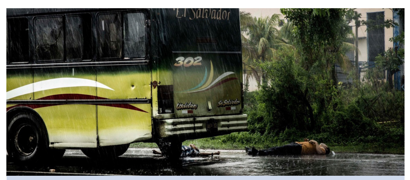
Photo caption: Victims' bodies on the ground after gang members killed six passengers in Olocuilta, El Salvador because the owner refused to pay extortion.

There are significant rumblings of changes underway inside the MS 13. Even as other gangs have fractured in El Salvador – in the case of the Barrio 18, into the Sureños and Revoloucionarios - the MS 13 alone has evolved politically, militarily and economically to challenge the survival of the state. There is now considerable debate over a possible split in the MS 13 in El Salvador, between the ranfla histórica (historic gang leadership, mostly in prison) and the ranfla libre (gang leaders on the outside