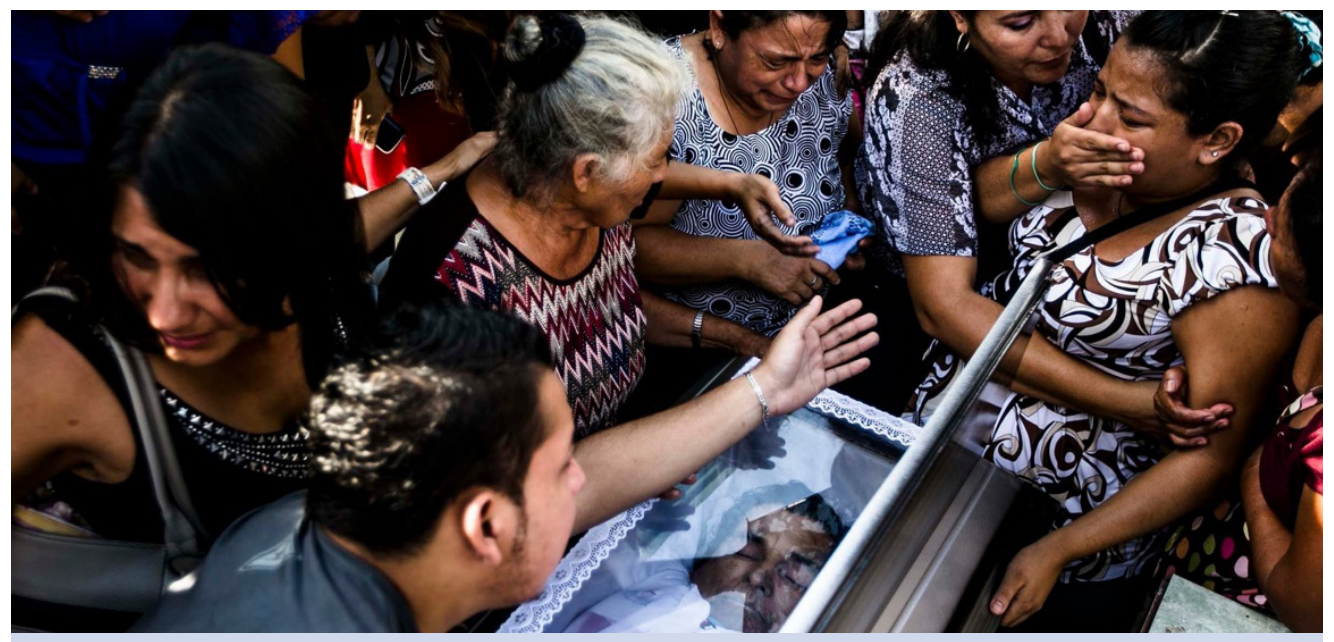
Photo caption: Family members gather at the funeral for a bus driver murdered by the Maras in Aguilares, El Salvador in September 2016.

While it has been long established that the gang leaders had directly negotiated with leaders of El Salvador's two main political parties, the magnitude of what was negotiated has recently come to light. Over the past year, the MS 13 has posted a series of YouTube videos and audio recordings of their leadership directly negotiating with leaders of the two main political parties, the right wing Republican Nationalist Alliance ( Alianza Republicana Nacionalista – ARENA) and the former guerrillas of the Farabundo Marti National Liberation Front ( Frente Farabundo Marti Para la Liberación Nacional – FMLN), for monetary gain and political power.