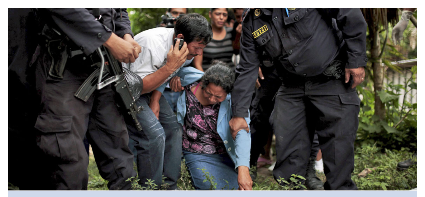
A mother grieves for her dead child, a victim of the extreme levels of violence in Central American countries.