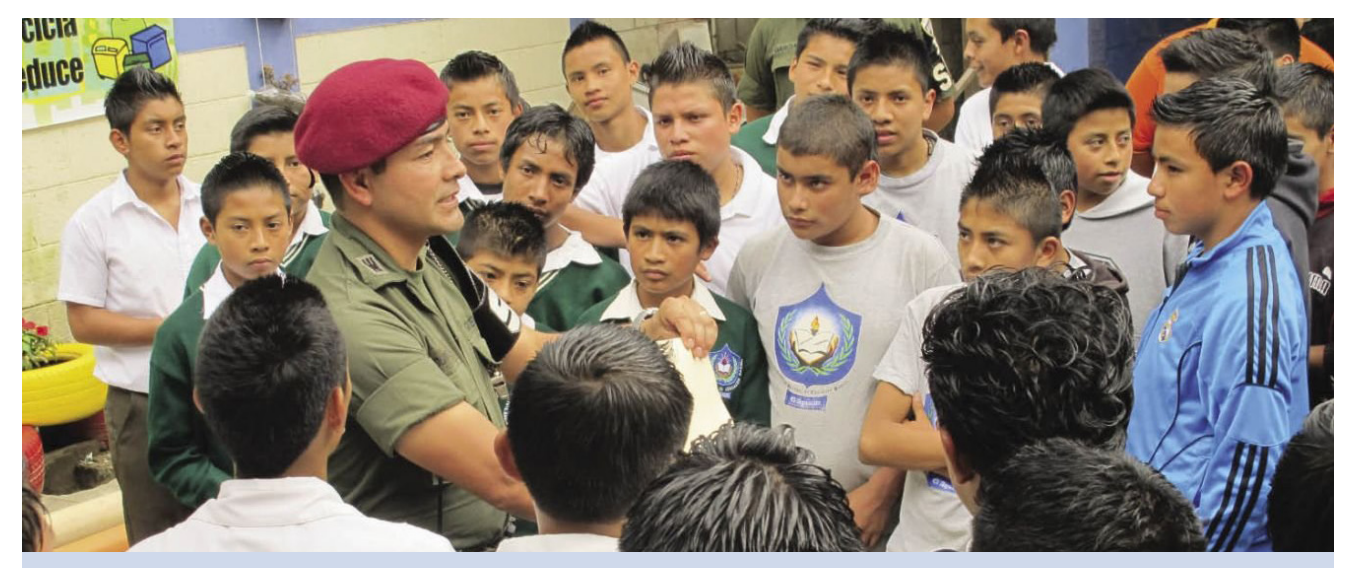
The "youth bulge" in many Central American countries presents a risk that disenfranchised young men and women may resort to criminal activities.

crackdowns, the police implemented suppression plans based on arbitrary interpretations of the existing laws. The general term referring to these policies was Plan Escoba (Operation Broom). The police jailed youth they suspected of gang membership by indicting them for possession of drugs, despite the fact that most of those detentions were carried out illegally.<sup>38</sup> With the inauguration of President Otto Pérez Molina in January 2012, an even more explicit mano dura policy was implemented.<sup>39</sup> In short, public security institutions were given a license to hunt gangs and youth based on flimsy legal constraints.