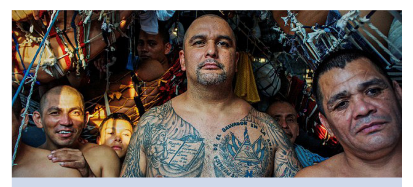
Overcrowding problems in jails in El Salvador are widely perceived to be contributing to the gang problem in the country because gangs use prison connections to build criminal networks.

in Central America.<sup>27</sup> Before suggesting an alternative policy, it may be worth reviewing the contrasting experience of Nicaragua.