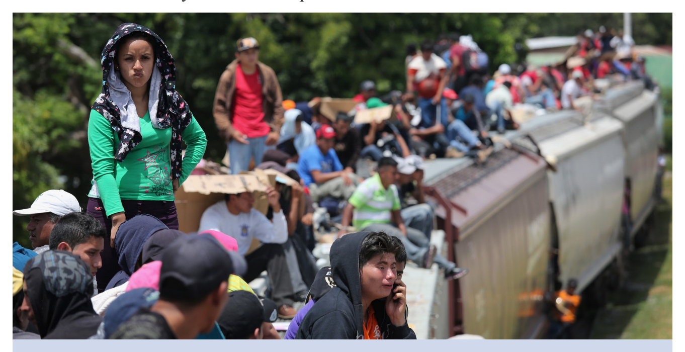
Central Americans ride a cargo train nicknamed "La Bestia" through Mexico in an attempt to reach the United States.

the Central American gangs issue has this to say on the topic: "Deportation policies played an important role in the evolution of gangs in the Central American region and a key role in the 'transnatalionalization' of the problem. As migration between the U.S. and the region continues to surge, the connections and influences between the gangs in each country have only become stronger." And according to the UN report, "There is a widely held belief in both Central America and the Caribbean that recent crime troubles can be tied directly to criminal deportees." 18