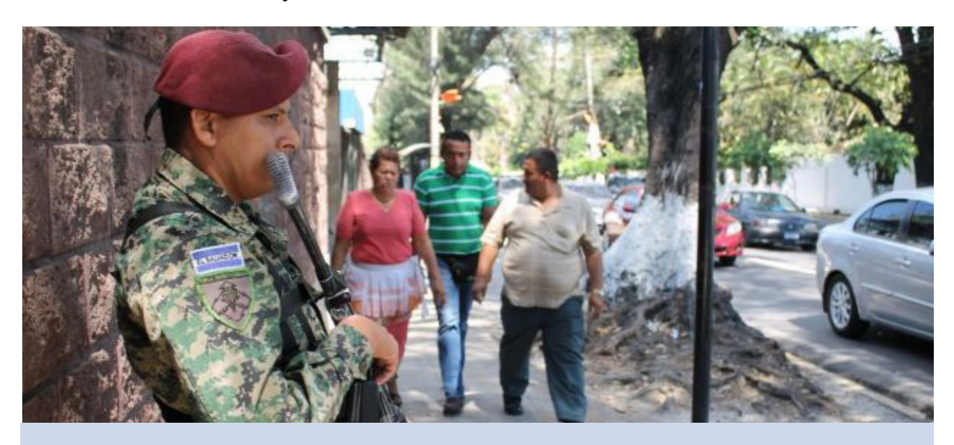
The Armed Forces in most Central American countries, as with this Salvadoran soldier, have been called to the streets to assist police with high levels of crime.

thor brought up the issue to middle class or upper - middle class groups of "you pay for what you get" in terms of security, there was total silence. If one reviews the CIA World Factbook , the data is illuminating. The percentage of tax revenue to GDP in El Salvador in 2014 was 20%, in Guatemala 12.6%, in Honduras 17%, and in Nicaragua 25%. <sup>45</sup> In Colombia in the same year it was 28.5%.