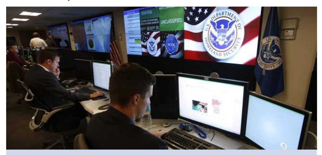
Fusion centers are essential to ensure unity of effort among security forces battling organized crime groups.

and Texas. In what follows, the author will first define intelligence fusion centers and then highlight three of the main points. He recommends exporting the intelligence fusion center concept to Central America.