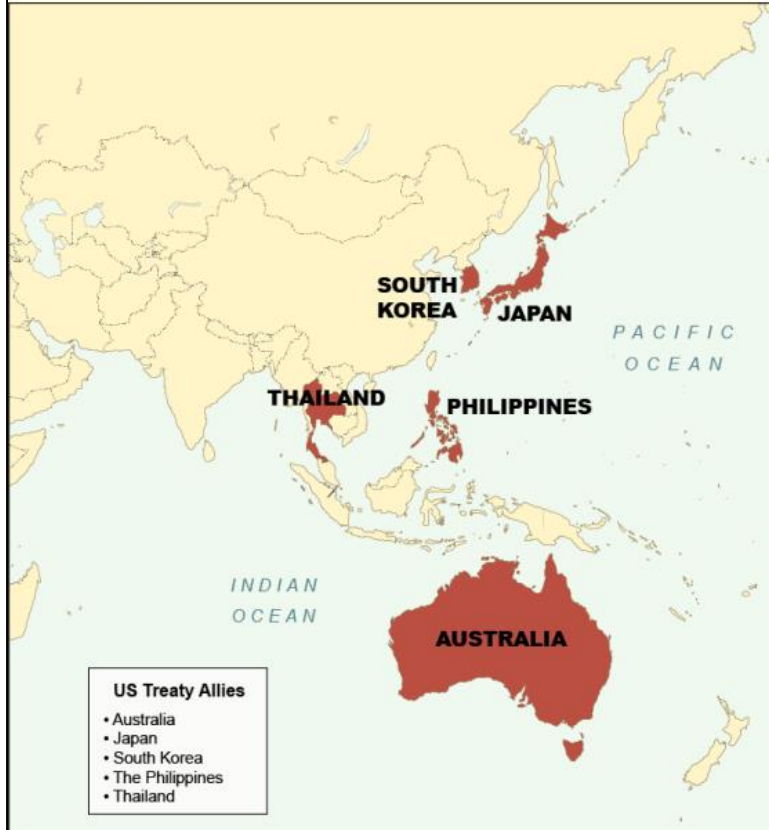
Figure 3. The United States Treaty Allies in Asia