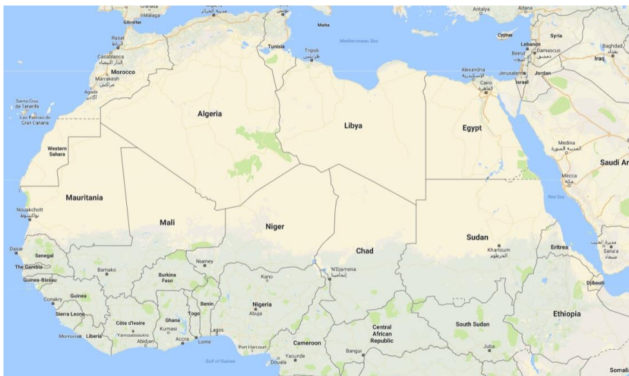
Figure 1: Map of North Africa and Sahel.

In some cases, the spread of IS into North Africa/Sahel was panned as a top-down strategy whereby the Caliphate has sent individuals to the region in order to establish territorial enclaves. In the majority of cases, however, the strategy has been that local groups have declared their loyalty to Baghdadi and in so doing have spontaneously chosen to affiliate themselves with IS. Concurrent to IS experiencing success on the battlefield, proclaiming the inception of the Caliphate and beginning to disseminate its violent propaganda videos, many militant IS groups in North Africa and Sahel have chosen to affiliate themselves with IS at their own initiative. However, this is mostly a case of complex, dynamic processes, whereby militant groups initially announce their support for IS and thereafter in some cases establish a more formal relationship with high-ranking IS emirs – if not outright official recognition from Baghdadi himself. Consistent with the fact that many foreign fighters from North Africa/Sahel have