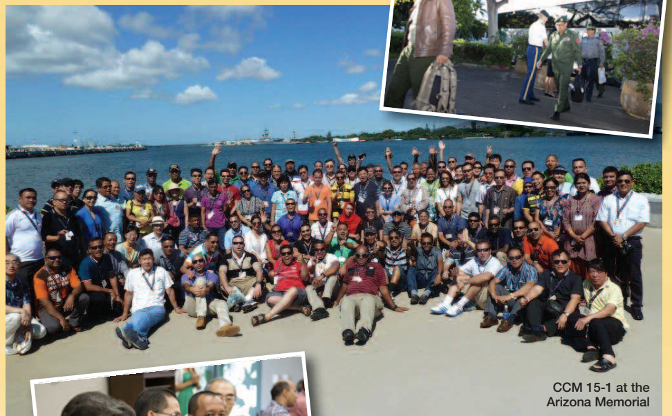
CCM 15-1 at the Arizona Memorial

Please use the following link to review course descriptions and course calendar. http://www.apcss.org/college/