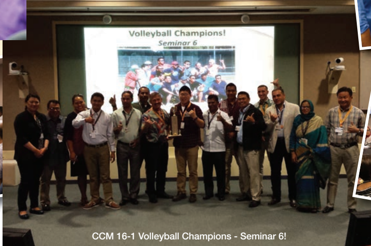
CCM 16-1 Volleyball Champions - Seminar 6!