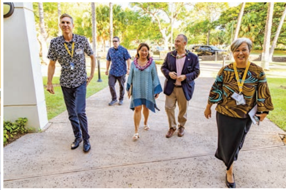
Above: Hawaii Governor Josh Green.