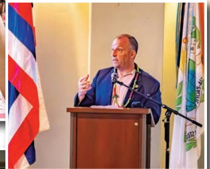
Above: Hawaii Governor Josh Green.