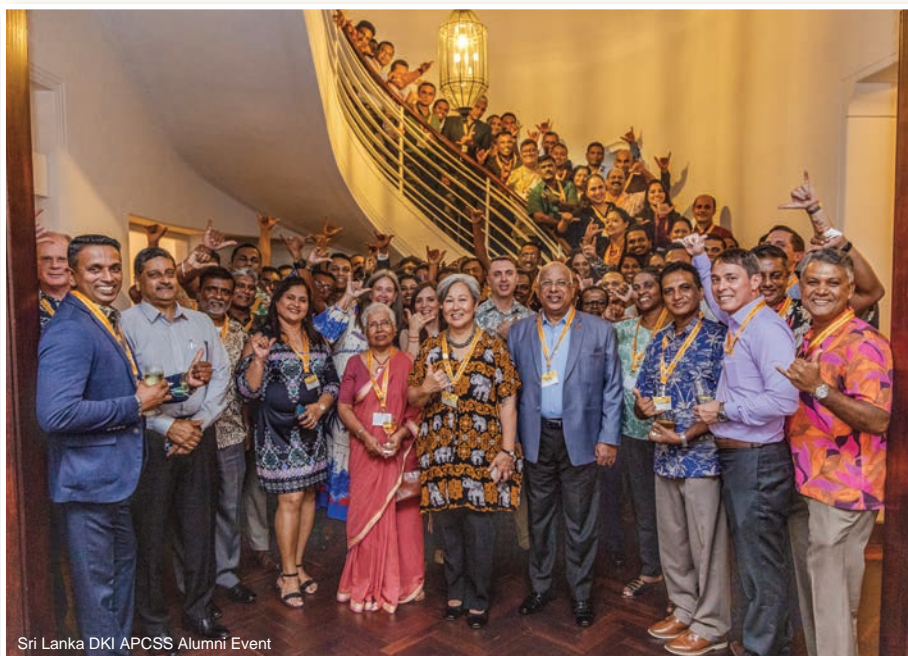
Sri Lanka DKI APCSS Alumni Event