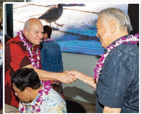
Above: Honolulu Mayor Rick Blangiardi