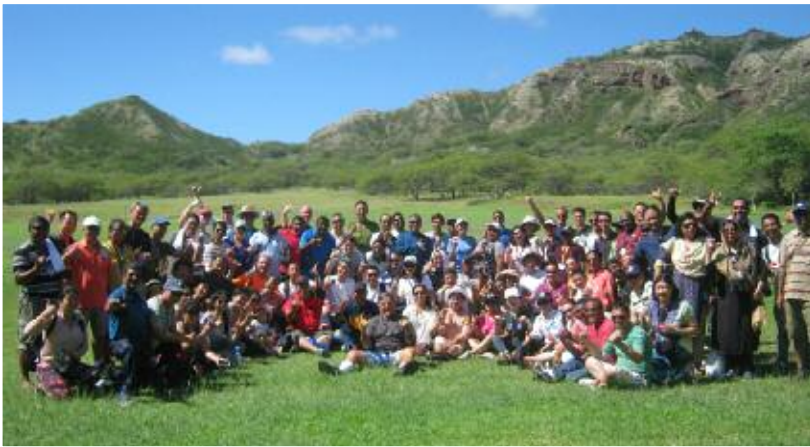
ASC 18-2 Diamond Head