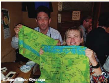
Colonel Takeo Kiyonaga

http://apcss.org/alumni/podcast/apcsslink_podcasts.xml