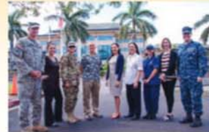
JIATF West Oceania Group