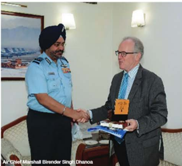
Air Chief Marshall Birender Singh Dhanoa